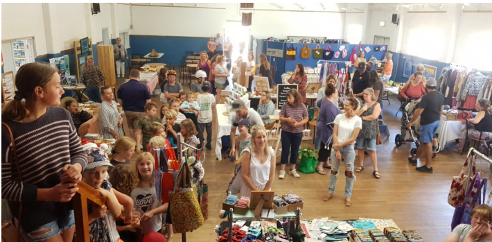
The Children lining up to meet Santa