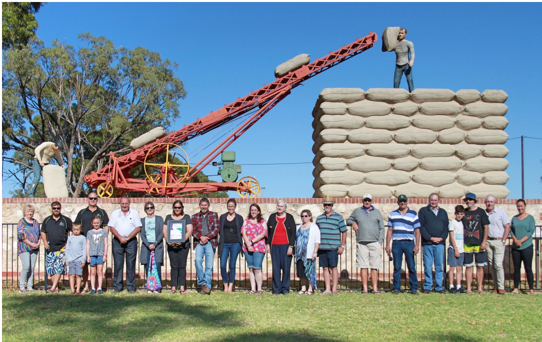
Members of the Lock Community

Community Event of the Year: Lock Community: BikeSA Eyre Peninsula Tour, Lock event