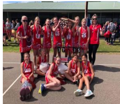
ELLISTON DISTRICTS E GRADE PREMIERS

Big congratulations to all the teams that made it to the finals. B Grade football and A Grade netball made it to the preliminary finals. The teams that made it to the grand finals were A Res, B, B Res, D and E grade netball. Great work by all and a HUGE CONGRATULATIONS to the Elliston Districts E Grade for winning the 2021 Premiership!