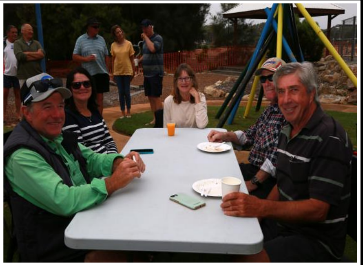
2022 Australia Day Event held at Trudinger Park.