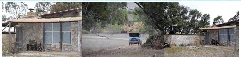
1. "Winfrith" Homestead 2. Fieldhouses Classic Car 3. "Winfrith"